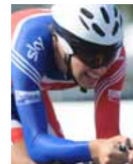
Endurance Cycling Alex Dowsett